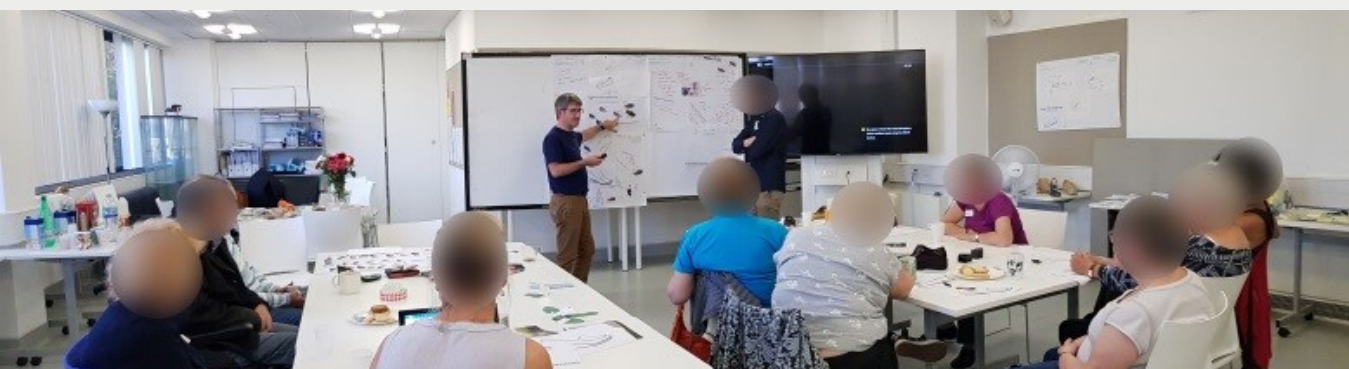
Maturolife co-creation workshop, 2018

Co-creation activities build empathy in the design professionals (designers, engineers, material scientists, researchers, etc.) involved as they see the perspective of the user more clearly and understand their requirements. Participants are provided insight into design processes, perspectives and methods and they may feel the satisfaction of contributing to important research, and that their contributions are valued.